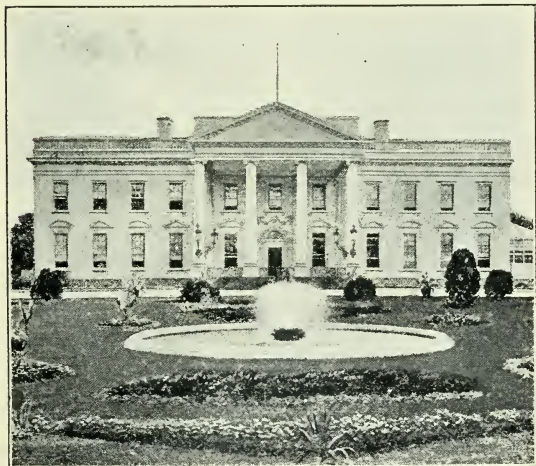
THE WHITE HOUSE AS LINCOLN ENTERED IT.